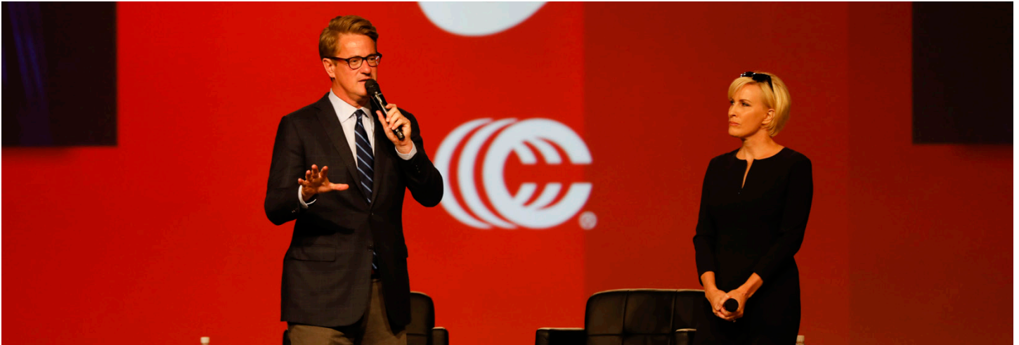
Joe Scarborough & Mika Brzezinski, Co-Hosts, MSNBC's Morning Joe