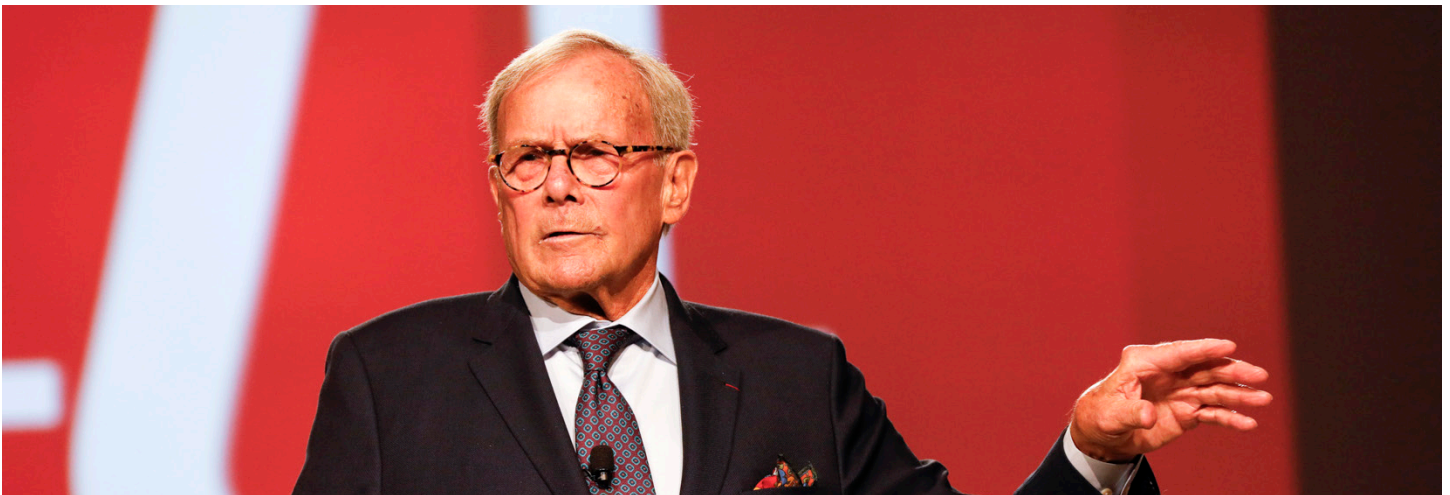
Tom Brokaw, Legendary Newsmen, NBC News