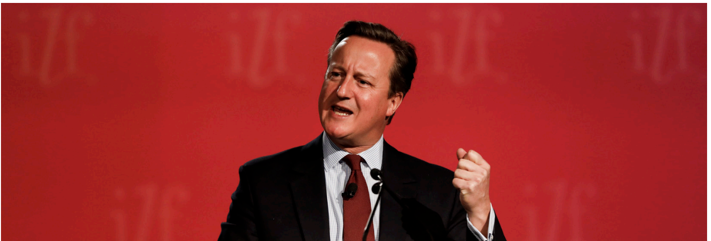
David Cameron, Former Prime Minister of the United Kingdom, 2010-2016