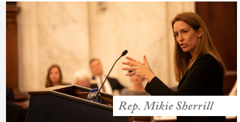
Rep. Mikie Sherrill