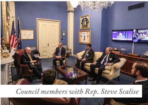
Council members with Rep. Steve Scalise