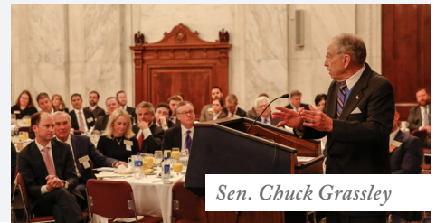
Sen. Chuck Grassley